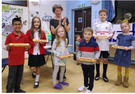
Winning designers from Guilden Sutton Primary School receive their prizes